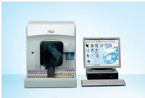
Fig. 1 The XT-4000i haematology system