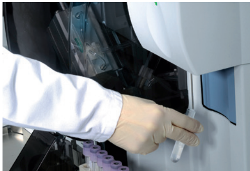
Fig. 2 Measuring body fluids using the XT-4000i with its integrated body fluid mode

With the launch of the XE-5000, Sysmex set new standards in haematology. Advanced clinical parameters that have been tested for effectiveness in clinical studies, embedded in a concept that combines laboratory data with clinical knowledge, offer both the laboratory physician and the clinician valuable support with different patient cases and in therapy monitoring. On top of this, the analyser features a special mode, which measures body fluids to convincing specifications.